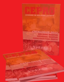
WELDING BOOTHS GRINDING BOOTHS